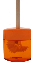
1 ENCLOSED PENCIL SHARPENER