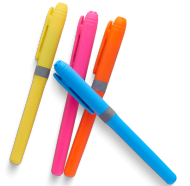
1 PACKAGE OF HIGHLIGHTERS