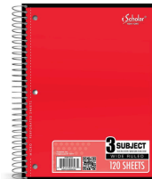
1, 3 SECTION NOTEBOOK