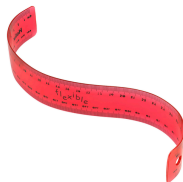
1 RULER FLEXIBLE