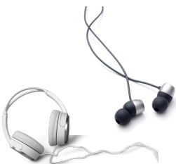
1 SET OF HEADPHONES FOR CHROMEBOOK (OPTIONAL)