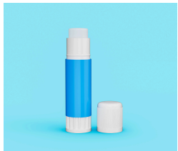
6 GLUE STICKS