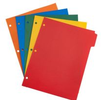
2 PACKS OF SUBJECT DIVIDERS