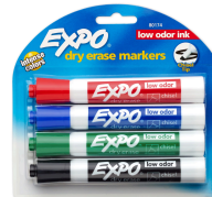
1 PACK OF DRY ERASE MARKERS