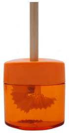
1 ENCLOSED PENCIL SHARPENER