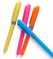
1 PACK OF HIGHLIGHTERS