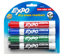
1 PACK OF DRY ERASE MARKERS