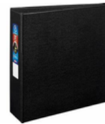
2, 3" HARD COVER BINDER