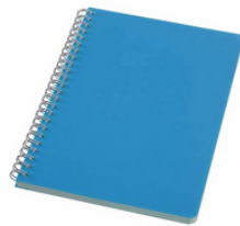
3 NOTEBOOKS (8 1/2 X11) FULL SIZE