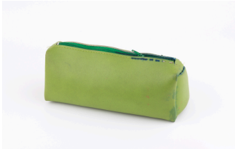
1 PENCIL CASE