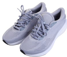
PAIR OF NON-MARKING INDOOR SHOES