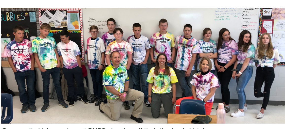
Community Helpers class at BHPS showing off their tie-dyed shirts!